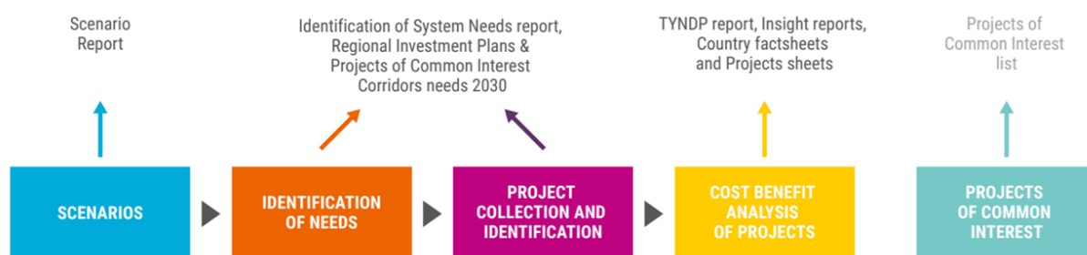
Figure 1: TYNDP process and PCI selection according to TEN-E, adapted from ENTSO-E.

The TYNDP scenarios comprise data and assumptions regarding the future demands for different energy carriers (such as electricity, methane, hydrogen, and liquid fuels) along with domestic resources and import potentials. Other inputs into the scenario modelling include projections of energy prices and the current and reliably planned infrastructure levels for electricity and gas grids, as well as generation and storage capacity. As the first step towards integrated energy system planning, the scenarios and assumptions for the development of electricity and gas grids have been streamlined since 2018.